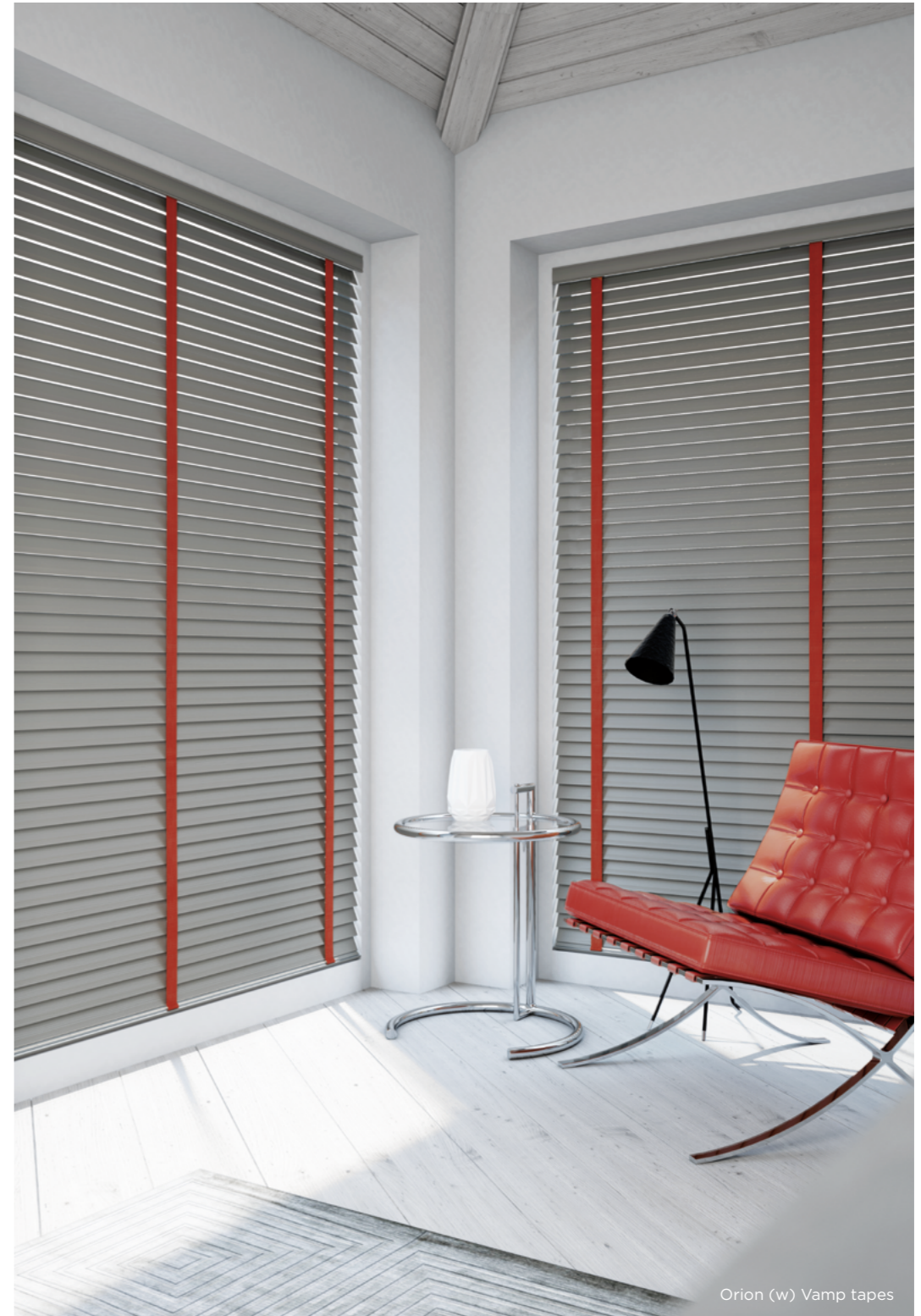
Orion (w) Vamp tapes

Emulating a sophisticated wood grain or a contemporary smooth finish, Faux Wood offers 35mm and 50mm slat widths. Crafted using high quality PVC, Faux Wood blinds are the perfect solution for areas of high moisture, such as kitchens and bathrooms.