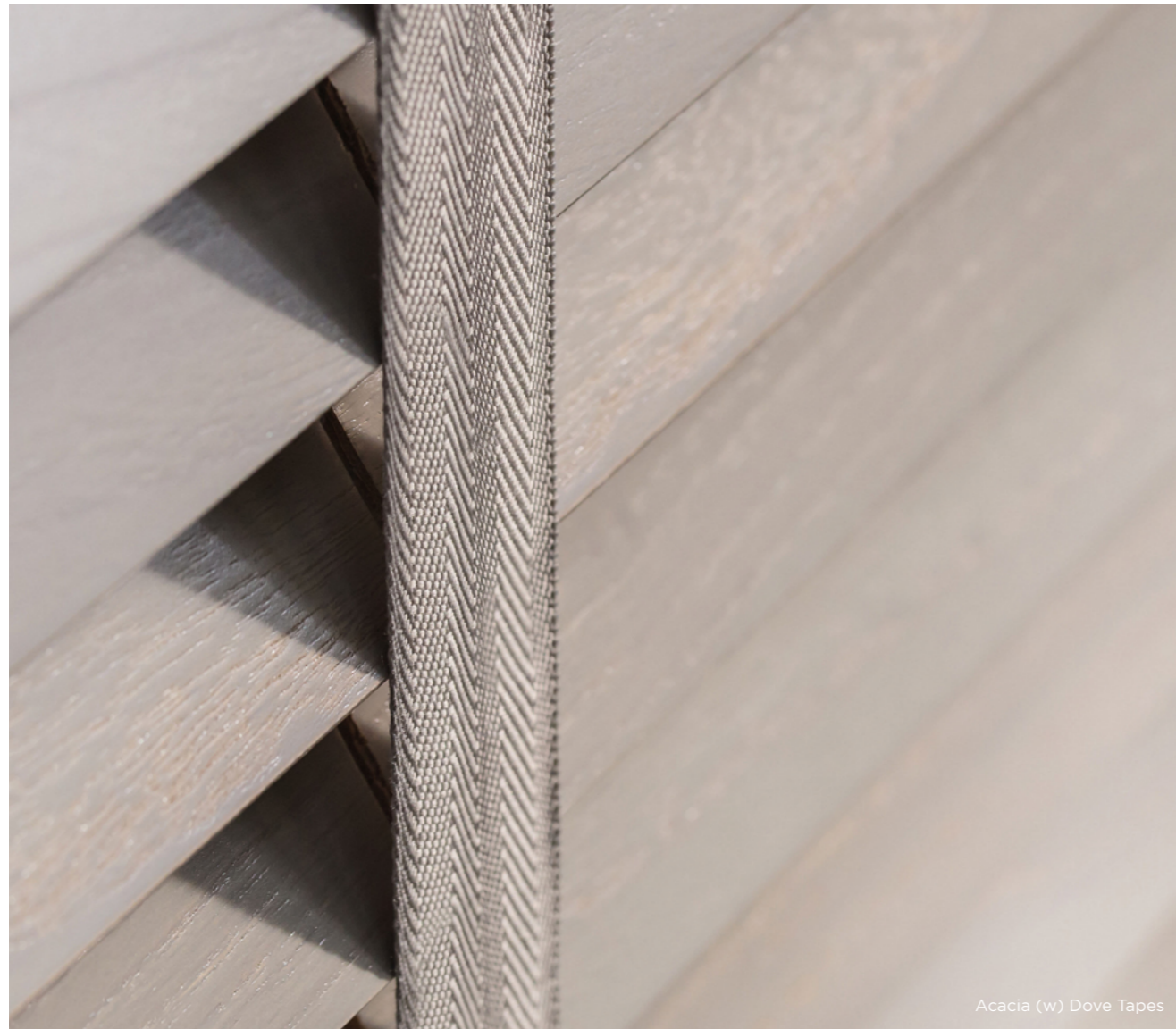
Acacia (w) Dove Tapes