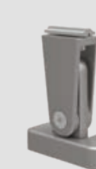
Adjustable support bracket top in 3 heights: 120–165, 165–210 and 210–255 mm