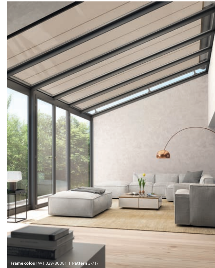
Frame colour WT 029/80081 | Pattern 3-717