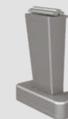
Fixed support bracket top in 4 heights: 80, 120, 150 and 220 mm

The WGM Top is available in the Stretch and OptiStretch versions that ensure optimum fabric performance and positioning. With the OptiStretch version , the fabric is firmly clamped on all four sides. The benefits: extremely taut fabric and no light gap on the sides. The basic Stretch version is clamped on two sides and there is a light gap between the fabric and side profile. A strong rope tension system ensures even fabric positioning with both versions.