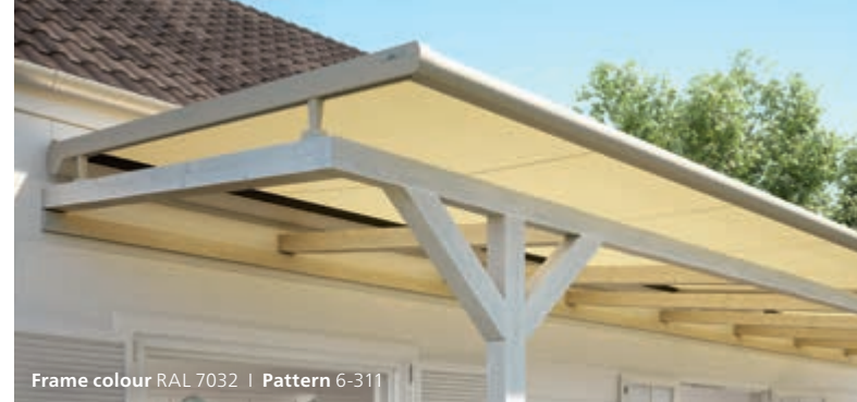
Frame colour RAL 7032 | Pattern 6-311

... and of course the weinor Terrazza/Glasoase® or any other veranda/glass room