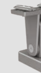
Adjustable support bracket top for multi-section units, in 3 heights: 120–165, 165–210 and 210–255 mm