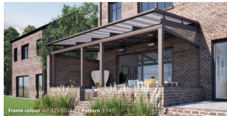
Frame colour WT 029/60740 | Pattern 3-745

The awning construction can also be used for conservatories integrated into the house